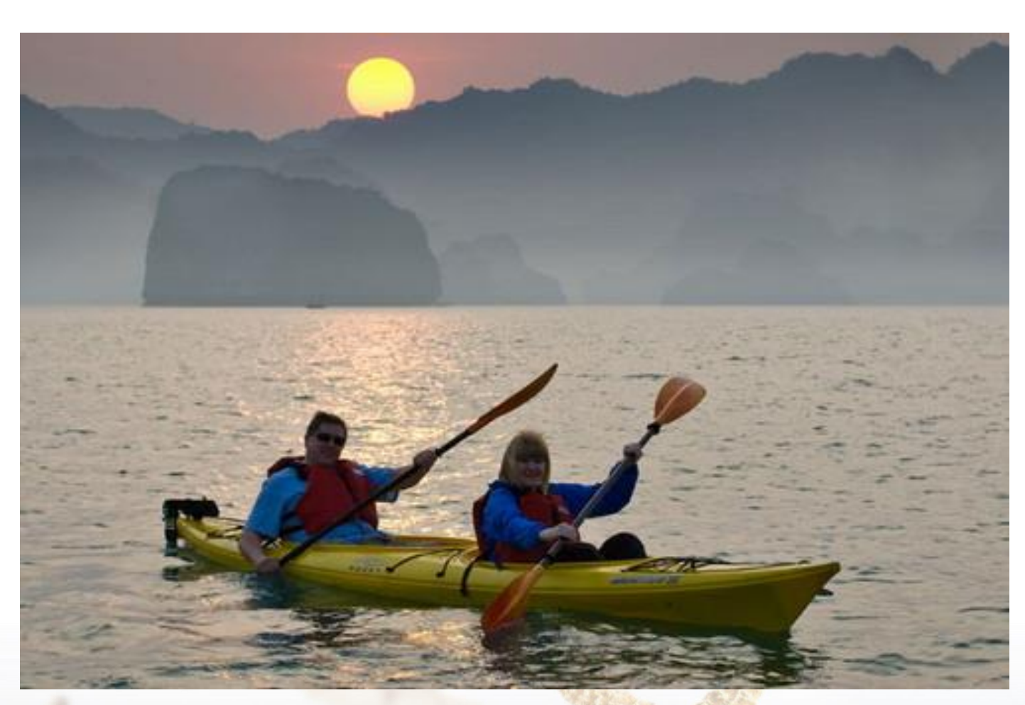
Kayak in Halong Bay