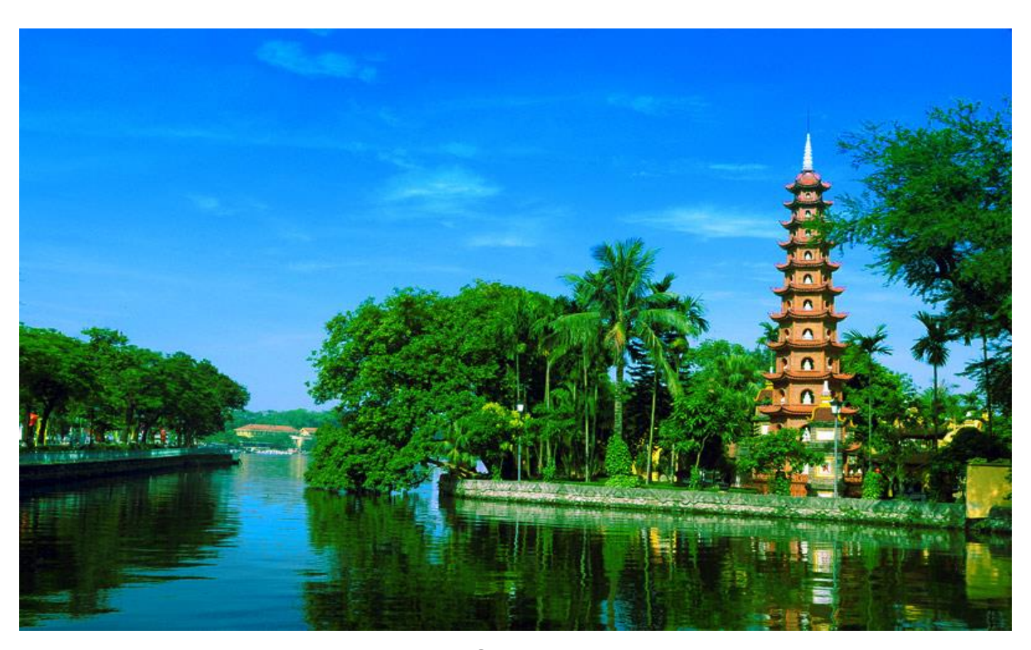
Tran Quoc Pagoda

Have breakfast at the hotel in Hanoi. Your leisure until we transfer you to airport for your departure flight.