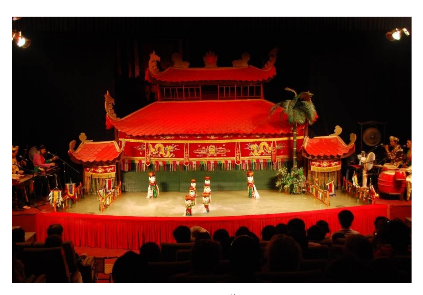
Water Puppet Show

You are arrival at our thousand years Capital – Hanoi city. Our driver will welcome you at the Noi Bai airport and then be transferred to your hotel in the center of city. ==> Sleep in hotel in Hanoi